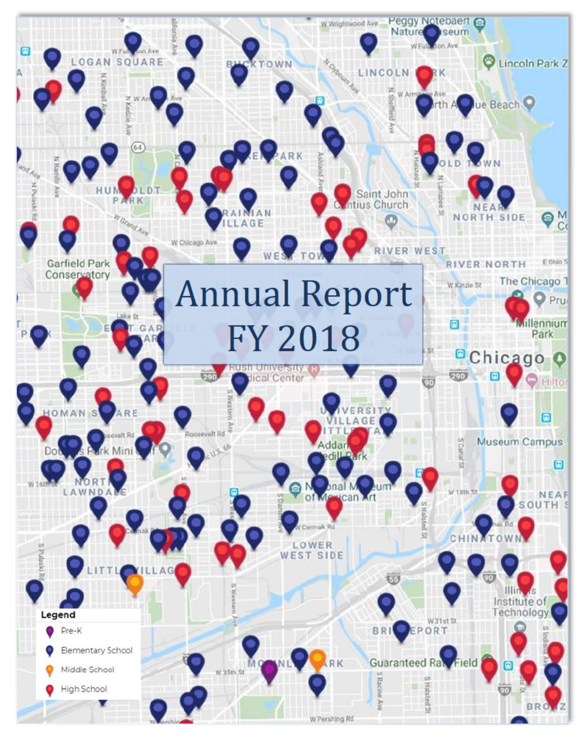
January 1, 2019